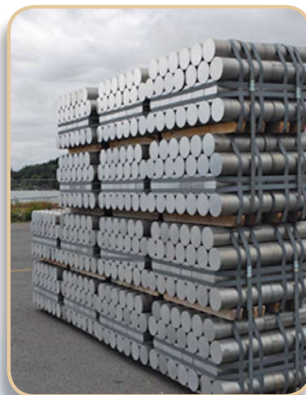
In 2007 Rio Tinto Alcan in Kitimat produced 241,738 tonnes of hot metal, cast into trilock, value-added sheet and aluminum ingot.